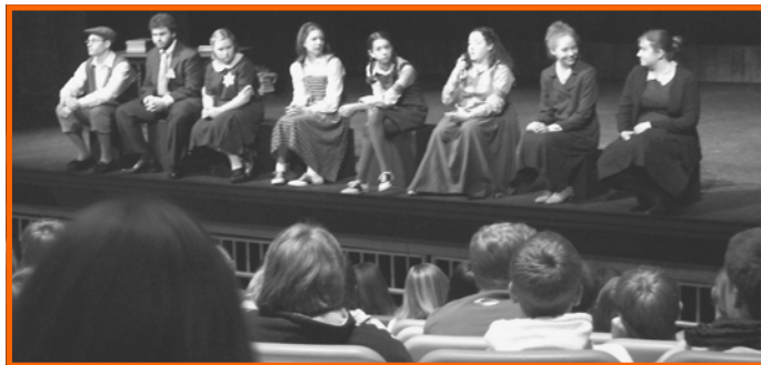
Performers in the play, The Library have a talk back with students participating in the conference.

Anne Frank wrote, “I don’t believe the war is simply the work of politicians and capitalists. Oh no, the average person is in every way as guilty, otherwise, people and nations would have rebelled long ago!” So many say they never understood what was happening. How likely could that have been? What rewards are there in society for collaborating with prejudice? What are the costs for trying to rescue?