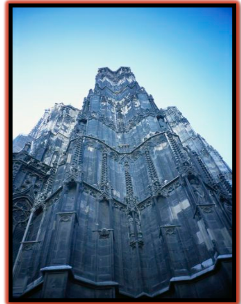
St. Stephen's Cathedral, Vienna: Mozart & Haydn met in Mozart's apartment nearby.

Today, the music of Haydn and Mozart is programmed in a variety of settings – from concert halls to train stations to advertising – and their lives have become the subjects of films, plays, and novels. What does this kind of appropriation indicate about the shifting meanings and value of their music? Throughout the course, we will balance our historical view of Haydn and Mozart with a critical evaluation of their significance in Western culture today.