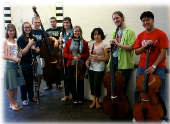
Members of Musica da Camera