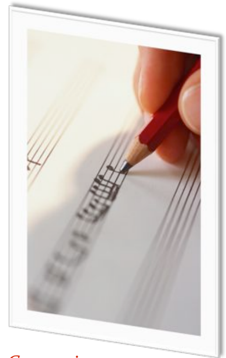
Composing contrapuntal music

Baroque musicians conceived of music in ways that go beyond the technical. Perhaps the most important goal of the course is learning to hear music in ways that are similar to the composers and performers of the time. This involves re-thinking many of the assumptions that we take for granted as 21 st Century musicians.” Members of the class spend the first part of the semester developing basic technical skills. Once these have been mastered, compositions ranging from English consort music to the Bach cello suites are analyzed. These pieces serve as models for student works that are discussed by the class during the compositional process and performed when they are completed.