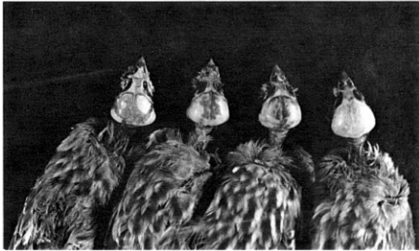
FIGURE 1. Differential extent of intracranial hemorrhaging (darkened or shaded areas of skull) in four window-killed White-crowned Sparrows ( Zonotrichia leucophrys ).