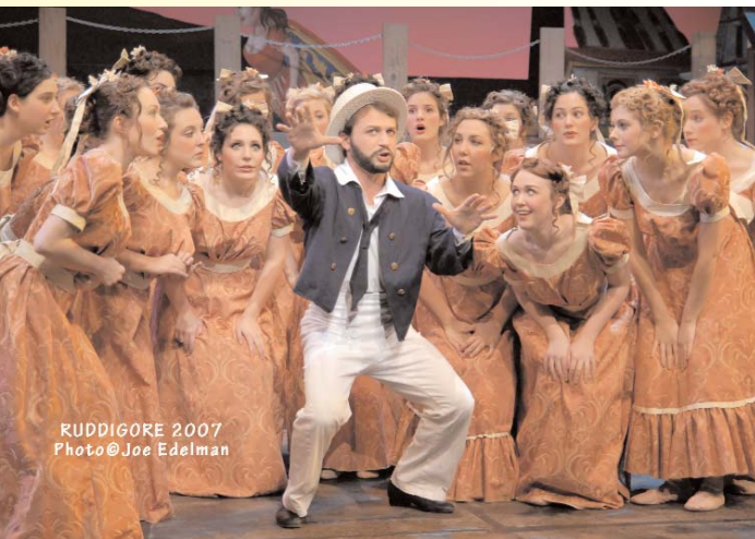
RUDDIGORE 2007

PLEASE NOTE THAT ALL EVENTS ARE FOR STUDENTS AND THEIR FAMILIES AND ARE FREE UNLESS OTHERWISE INDICATED.