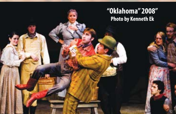
"Oklahoma" 2008

The Office of Admission will offer interviews to siblings of current Muhlenberg students. Interview appointments will be available (on a first-come, first-served basis) for high school seniors on Friday, October 30 from 9 a.m. to 3:30 p.m. and Saturday, October 31 from 9 a.m. to noon. A group information session for sophomores and juniors will be available on Saturday at 11 a.m. Please call the Office of Admission at (484) 664-3200 to make an appointment for either an interview or group information session. (Please identify yourself as a Muhlenberg parent or sibling when you call).