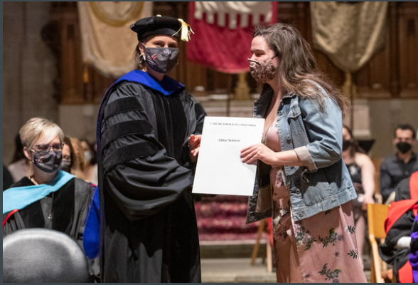
DR. EDWIN R. BALDRIGE PRIZE