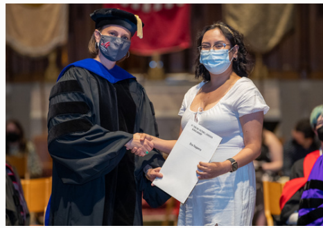
DR. VICTOR L. JOHNSON AWARD