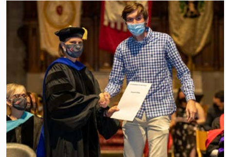
THE RUSSELL-FULFORD AWARD