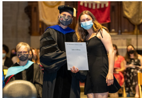
THE HYMAN-GOODMAN AWARD